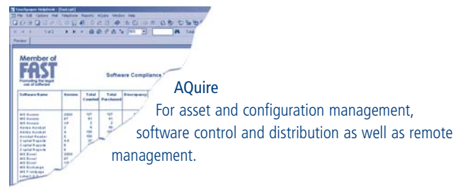
FAST Software compliance report using AQuire